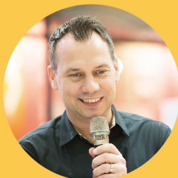
Sebastian Fitzek Author, Germany