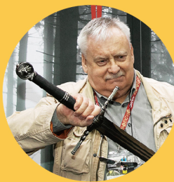
Andrzej Sapkowski Author, Poland