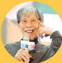
Taro Gomi Author, Japan