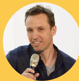
Markus Zusak Author, Australia