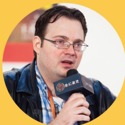
Brandon Sanderson Author, USA